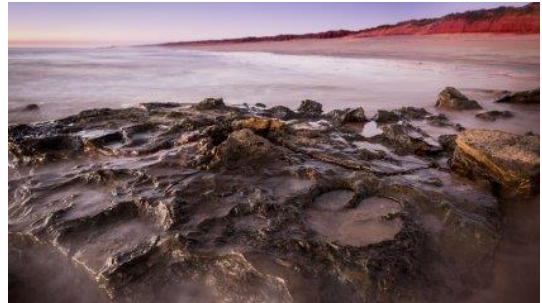
DINOSAUR TRACKS IN THE WALMADANY AREA.

https://www.uq.edu.au/news/article/2017/03/australias-jurassic-park-worlds-most-diverse