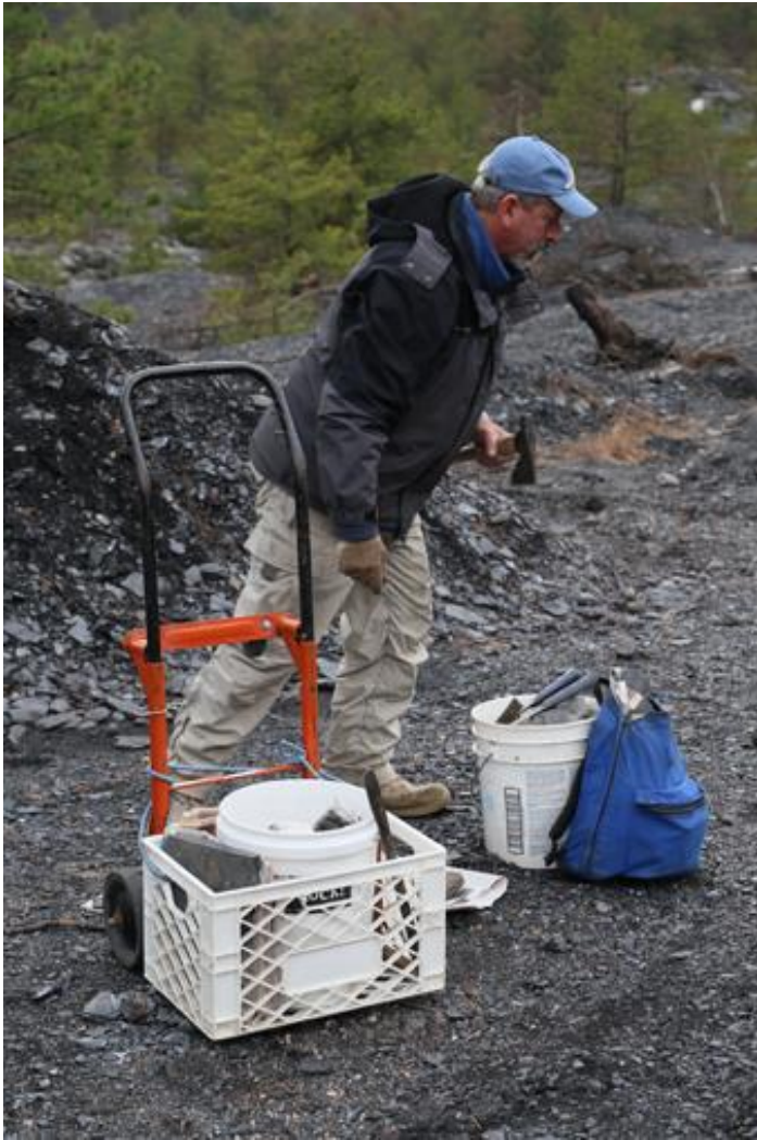
St. Clair, PA - November 10, 2013