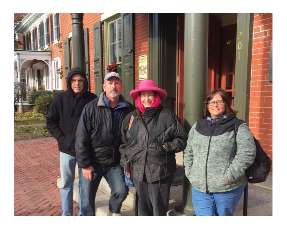
C & D Canal, DE