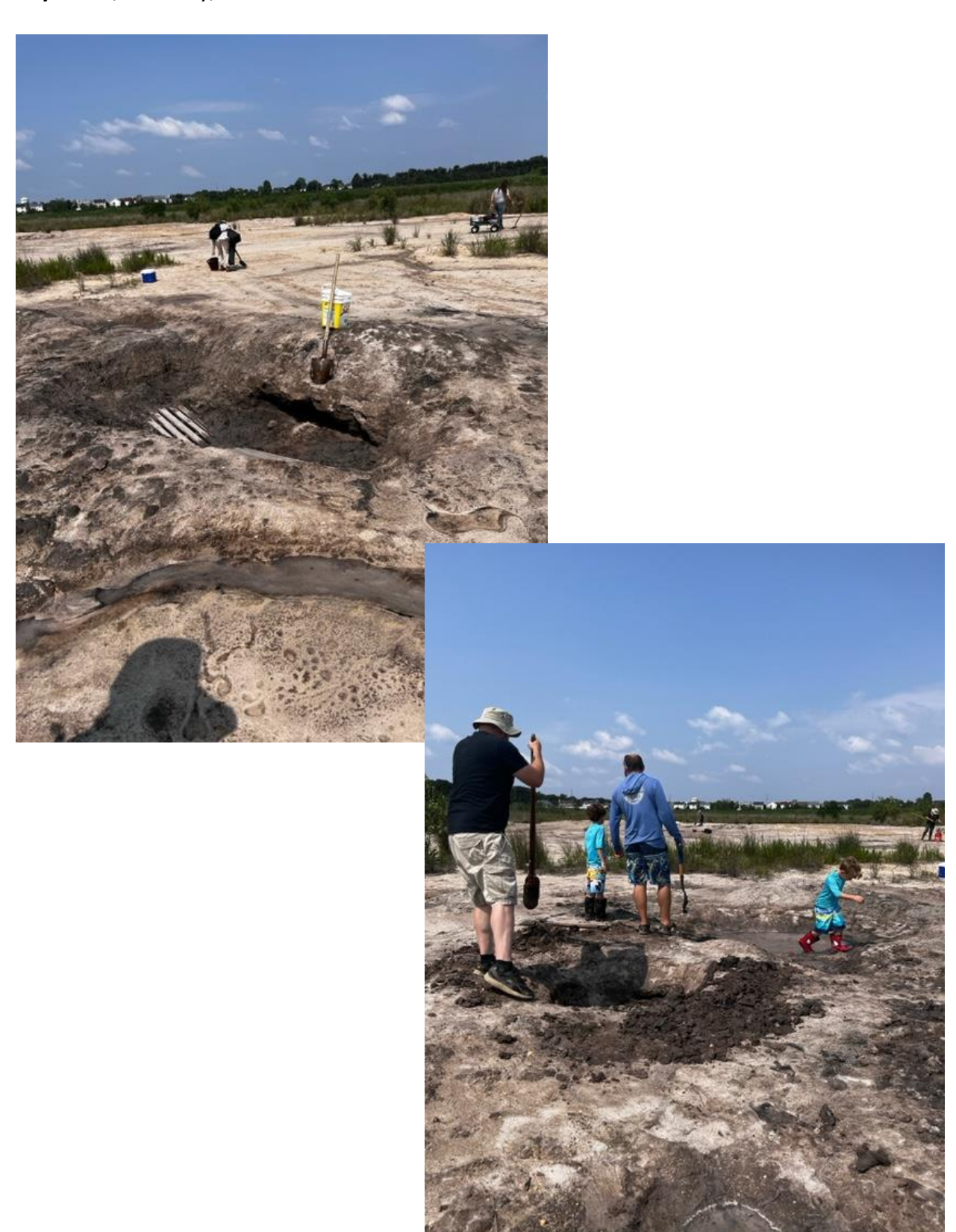
Sayreville, Saturday, June 17th