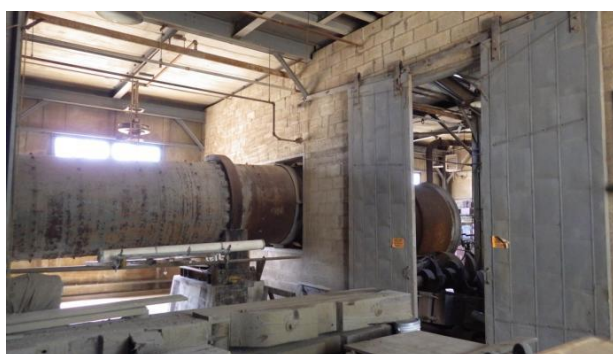
Conveyor of last ore from 1986.