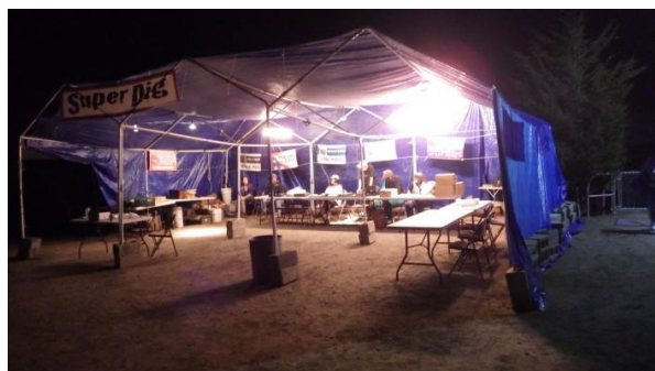
The rush to get registered, check in-check out tent.