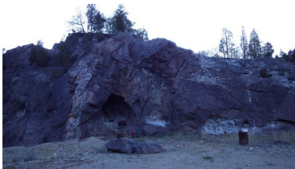
Dusk view of "Horse Head Ore Vein".