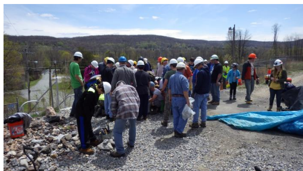
Special specimens for collecting uncovering.