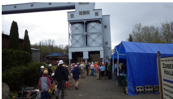
Preparations on Friday in the check in-check out tent.