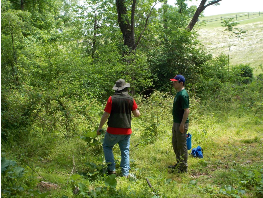
A fine specimen of Green Ballite