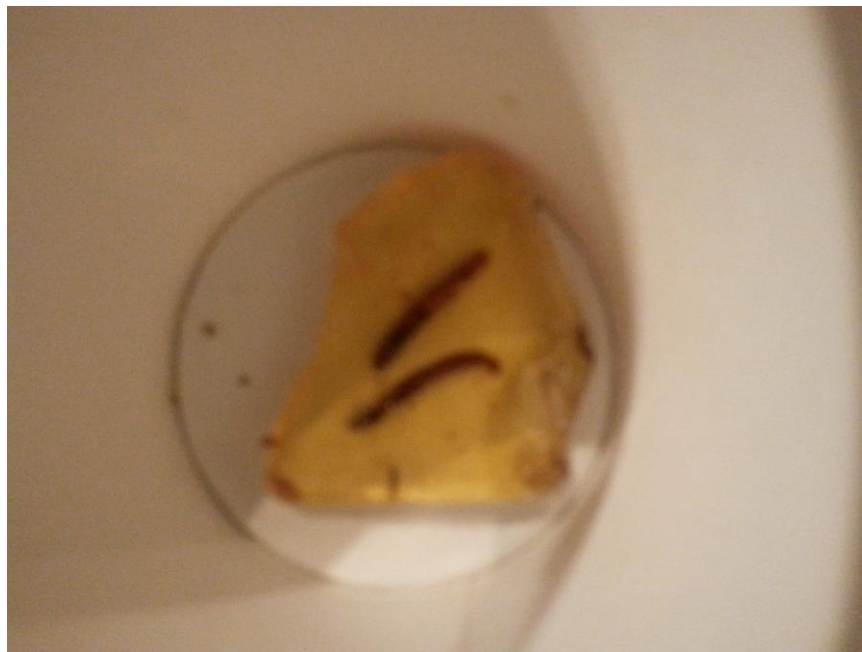
Candy amber with real edible insects.

Paleo-Palooza: March 3 rd and 4 th at the Academy of Natural Sciences in Philadelphia.