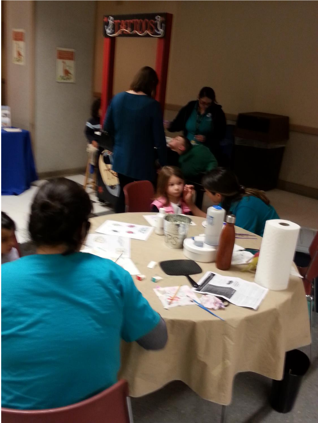
Face painting and temporary dinosaur tattoos for kids.