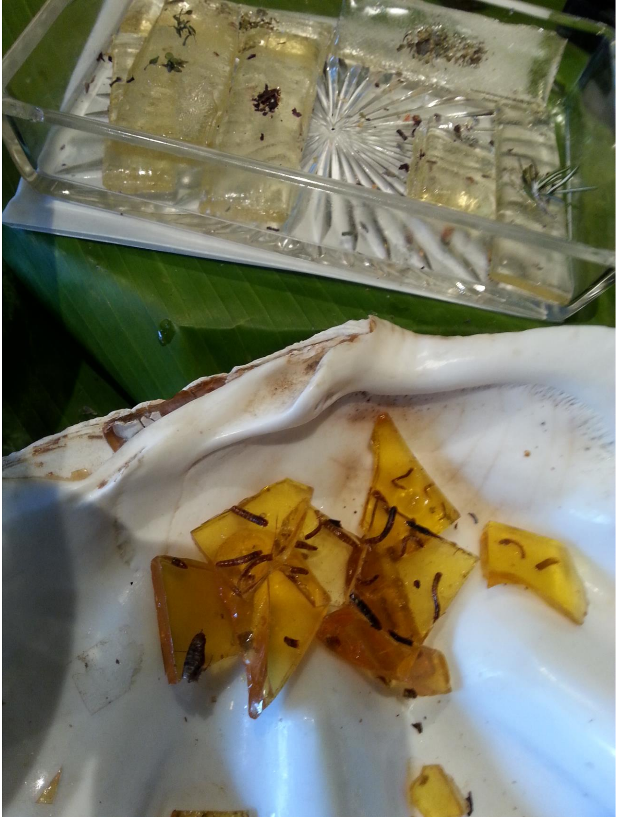
Candy amber with real edible insects created by the confectionery artists.