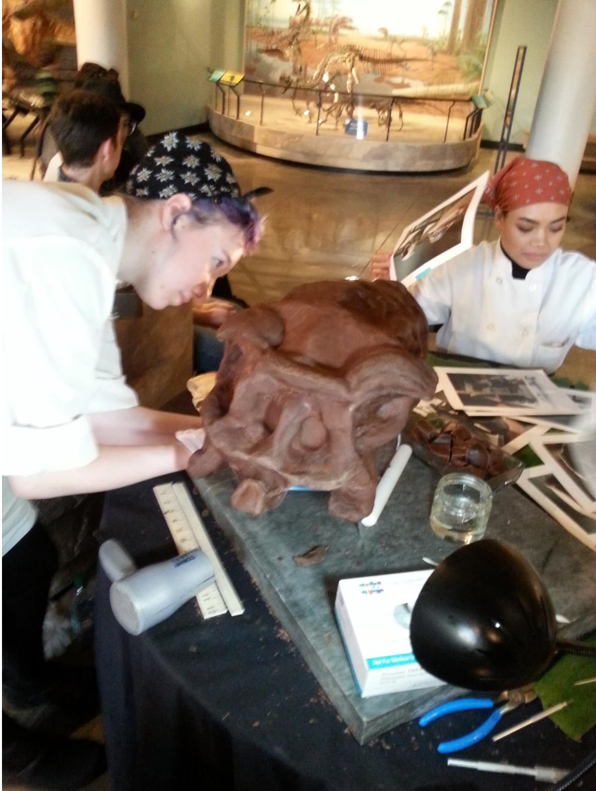
Franklin Fountain and Shane Confectionery artists use sculpting chocolate to build a full sized hadrosaur skull.