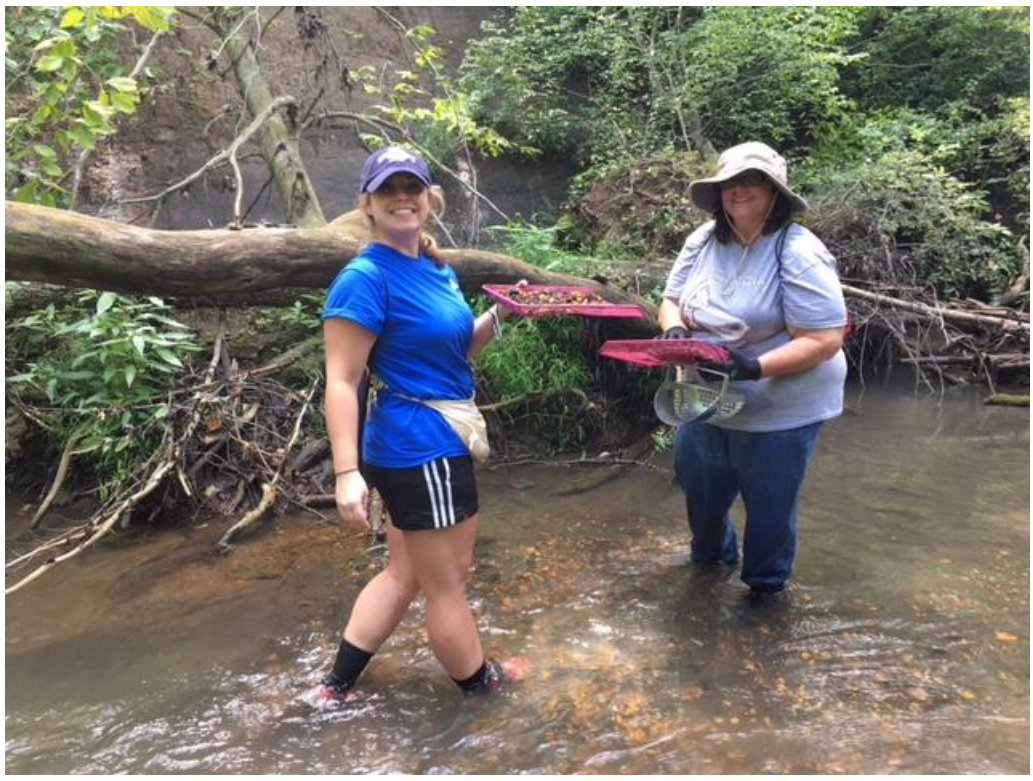
DVESS Newsletter September 2017