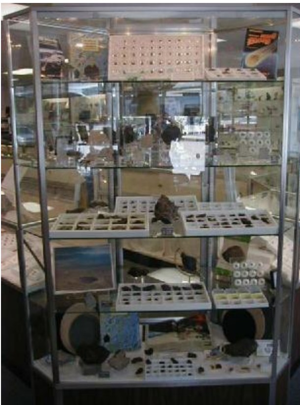
Up close and personal.